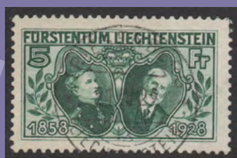
ex 1490 Est.£300