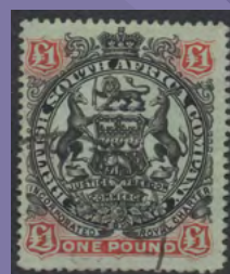
ex 1801 Est.£110