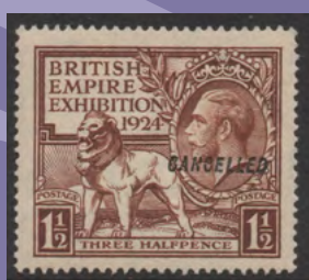
ex 2313 Est.£1000